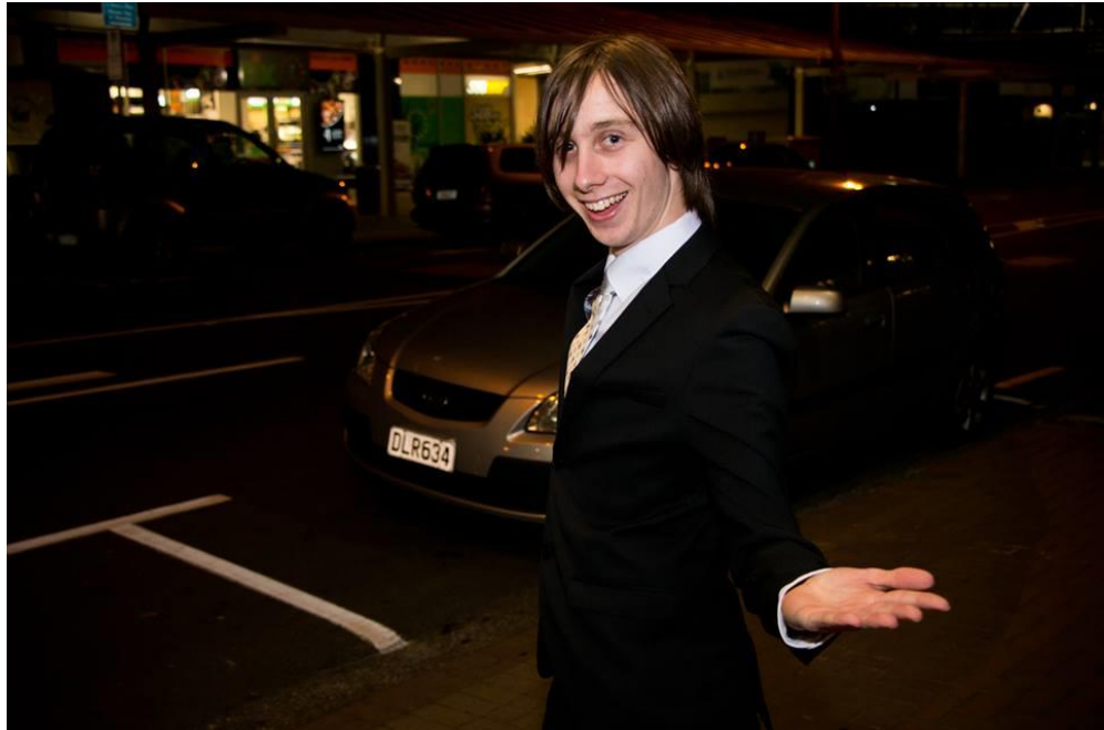
I was the doorman for the VUW Languages and Cultures Ball 2014, organised by the VUW French Society.